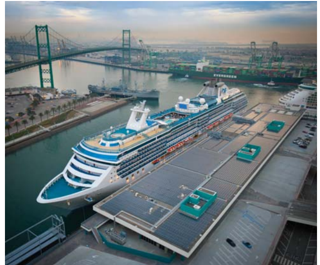
Port of Los Angeles

This project is a joint effort of the California Department of Transportation and the Port of Long Beach with funding also from the U.S. Department of Transportation and the Los Angeles County Metropolitan Transportation Authority.